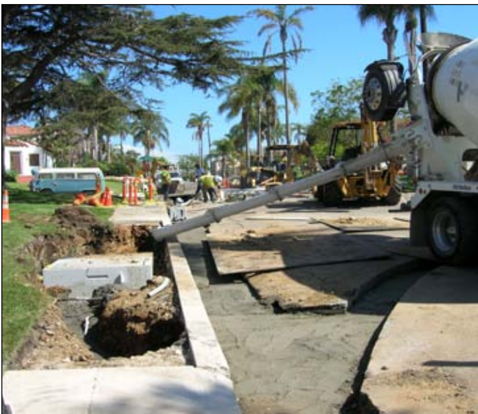
Cement pouring on the 2300 block of Hickory Street.

You have likely have seen Cass Construction digging trenches in the streets. Trench work is approximately 70% complete in Project Block 2E. We ask for your patience as they complete this work, as it can be disruptive and distracting. Approximately two weeks prior to the start of the trench work on your property and in the street, you will receive a door hanger with the trenching contractor's name and phone number on it. If you have any questions or concerns about the work, please do not hesitate to contact the contractor.